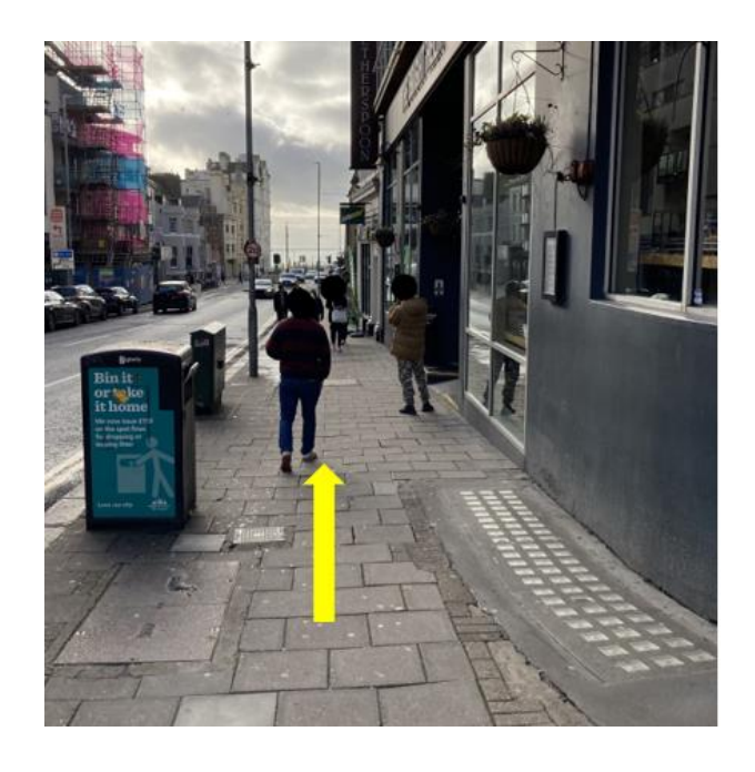
Turn right onto Russell Road.