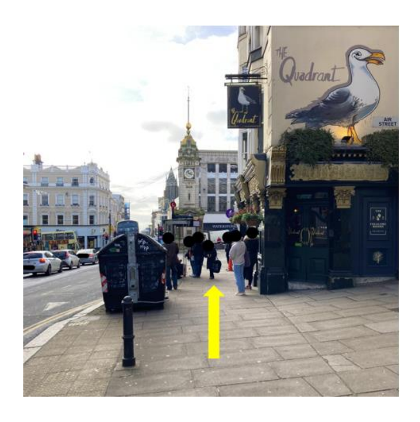
Follow the walkway towards Waterstones.