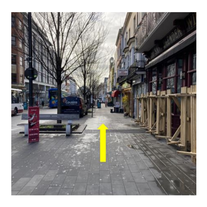
Cross over at the traffic lights and continue straight ahead.